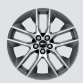
20" x 9" Foundry Black-Painted Machined Aluminum Optional: EcoBoost Premium, GT Premium