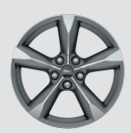
18" Foundry Black-Painted Machined Aluminum Included: V6 051A Optional: EcoBoost, EcoBoost Premium, GT, GT Premium