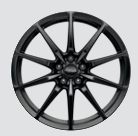
19" x 10.5" Front/19" x 11" Rear Ebony Black-Painted Aluminum Standard: Shelby GT350