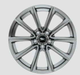
19" Premium Dark Stainless-Painted Aluminum Optional: GT Premium