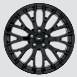
19" x 9" Front/19" x 9.5" Rear Ebony Black-Painted Aluminum Included: GT Performance Package