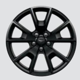
19" Ebony Black-Painted Aluminum Included: GT Black Accent Package