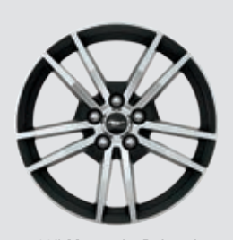
18" Magnetic-Painted Machined Aluminum Standard: EcoBoost,® EcoBoost Premium, GT, GT Premium