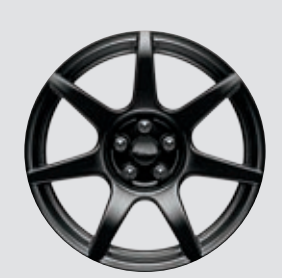
19" x 11" Front/19" x 11.5" Rear Ebony Black-Painted Carbon-Fiber Included: Shelby GT350R Package