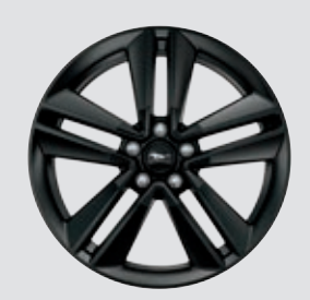
19" Ebony Black-Painted Aluminum Included: EcoBoost Performance Package