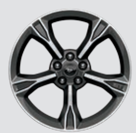
19" Ebony Black-Painted Machined Aluminum Included: GT Premium California Special