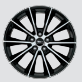
19" Low-Gloss Black-Painted Machined Aluminum Included: EcoBoost Interior & Wheel Package, Wheel & Stripe Package, GT Interior & Wheel Package