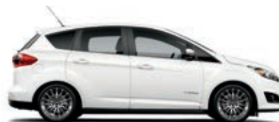
White Platinum Metallic Tri-coat