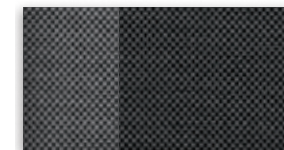
2 Charcoal Black Cloth with Warm Steel Accents