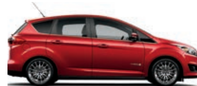
Ruby Red Metallic Tinted Clearcoat