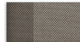
1 Medium Light Stone Cloth with Medium Dark Stone Accents