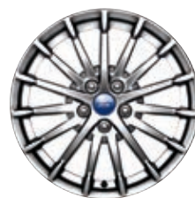
17" Sparkle Silver-Painted Aluminum Standard