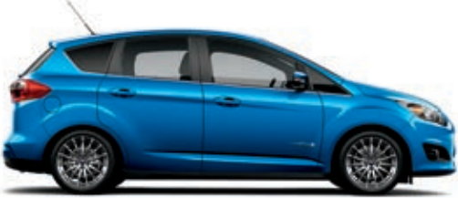
Blue Candy Tinted Clearcoat Metallic