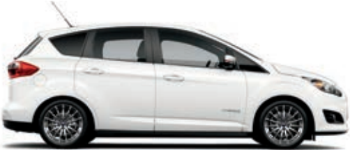
White Platinum Tri-coat Metallic