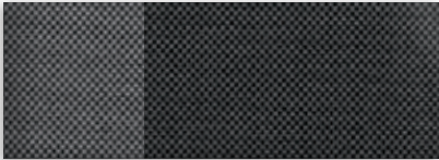
2 Charcoal Black Cloth with Warm Steel Accents