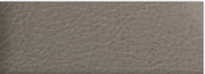
3 Medium Light Stone Leather