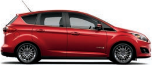
Ruby Red Tinted Clearcoat Metallic