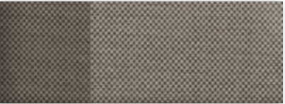
1 Medium Light Stone Cloth with Medium Dark Stone Accents