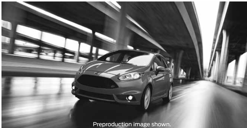
Preproduction image shown.