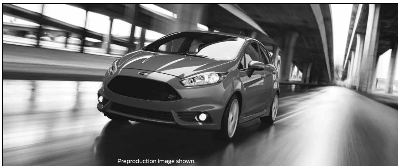
Preproduction image shown.