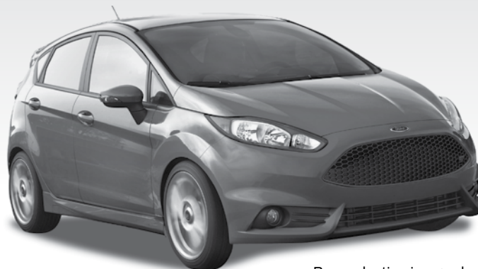
Preproduction image shown.

Enhanced Torque Vectoring Control (p. 53)