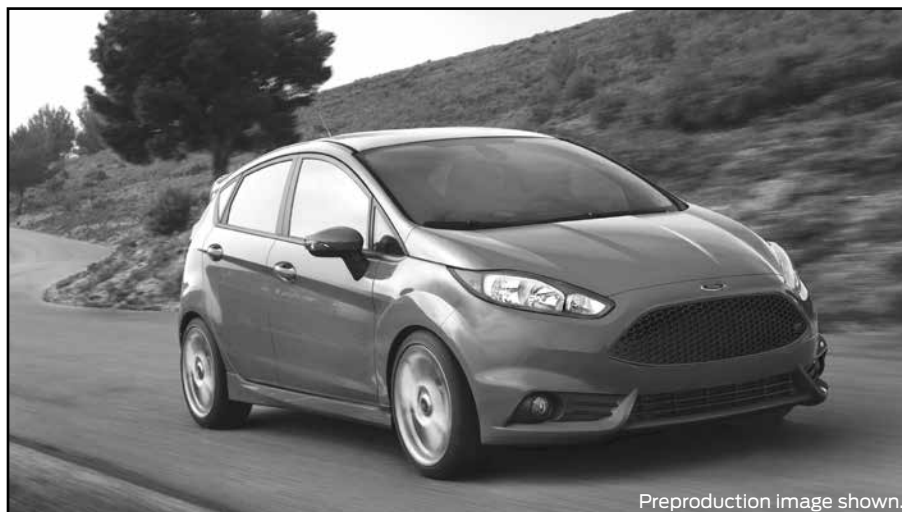
Preproduction image shown.