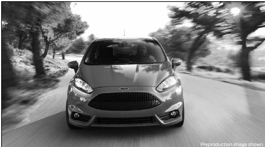
Preproduction image shown.