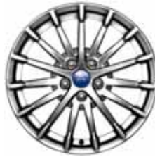
17" Machined Aluminum Standard