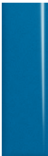
Blue Candy Metallic Tinted Clearcoat