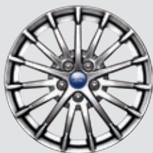
17" 15-Spoke Sparkle Silver-Painted Aluminum